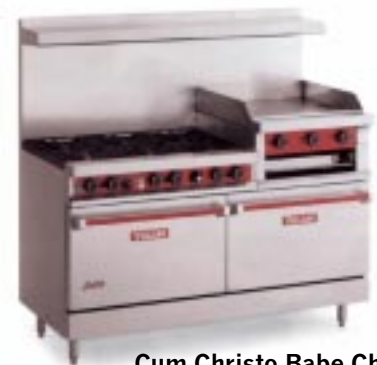
Cum Christo Babe Chick

While we mourn the loss of one so dedicated, we know that Heaven awaits her continued service. But as we say good-bye and God speed to one cursillista, we welcome our newest babe chick to service. May he be around for many years to come.